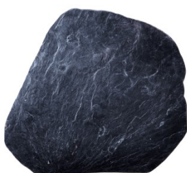
Status upon delivery

The roe deer plates XL provide freedom of design. Mount your hunting trophies any way you want. We recommend to wall mount the roe deer plates XL by using 4 doweled screws. Please execute the drills as indicated in section 1 of this mounting advice.