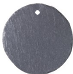
Status upon delivery

Boar plates are delivered with one hole for installation of a wall mount. The boar tusks can be attached by using a regular glue.